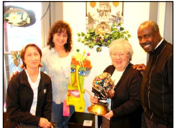
Lake Orion's Look for the Good Recreate Art Show